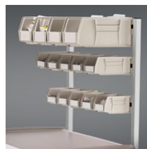
Bulk Storage Bins