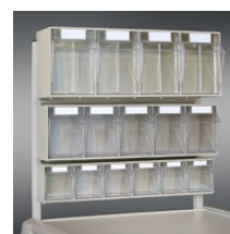
Tilt Bin Organizer