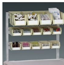
Bulk Storage Bins